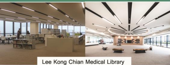
Lee Kong Chian Medical Library