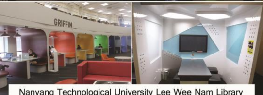
Nanyang Technological University Lee Wee Nam Library